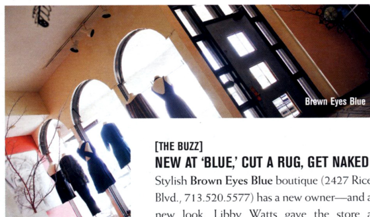
Brown Eyes Blue